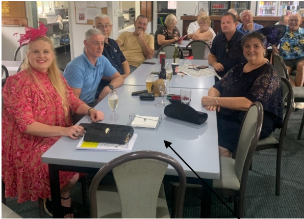
Staff of good life