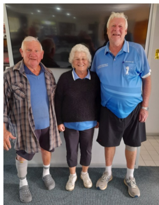
Vets Championship Winners for 2022